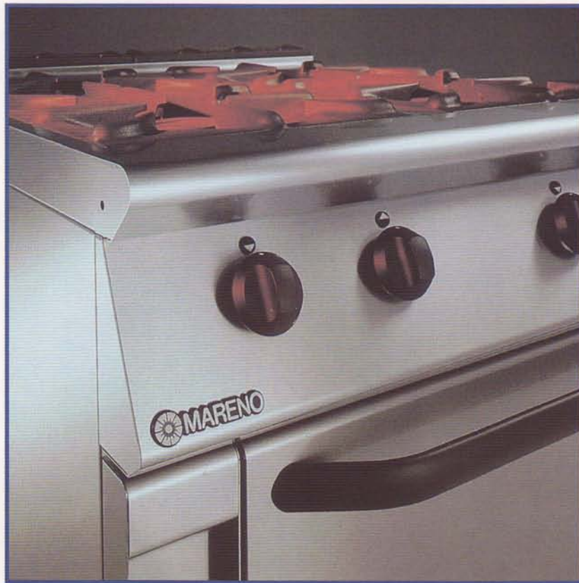
PROTAGONISTA COOKING RANGE: 90 SERIES

FOODSERVICE EQUIPMENT MARENO SYSTEM FOR CATERING EQUIPMENT