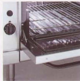
Detail of oven interior