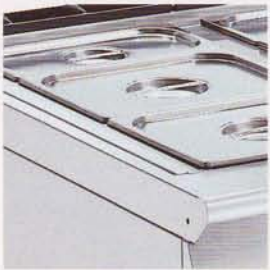
Basin with "Gastro Norm" containers