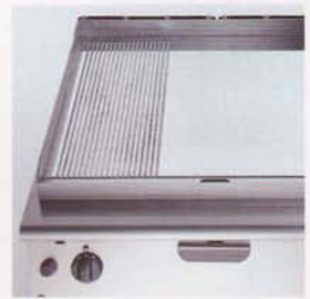
Detail of mixed version plate (1/3 ribbed, 2/3 smooth)