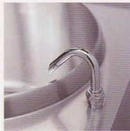
Detail of water inlet tap