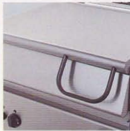
Lid to be used as working top