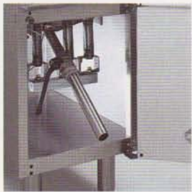
Oil drain extension tube