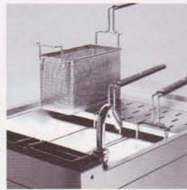
Basin and basket