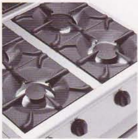
Detail of pan supports and burners