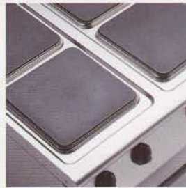
Detail of hotplates