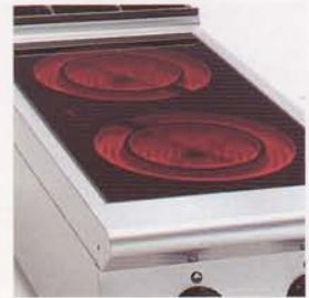
Detail with lighted heating elements