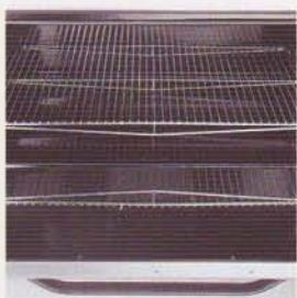
Detail of maxi-grill and stainless steel door frame