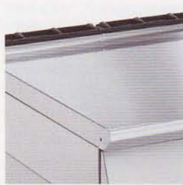
Neutral working top